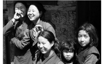
Students in the school yard