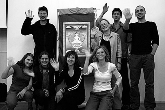
Board and Administration