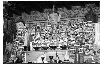
Kangyur and Tengyur in the monastery