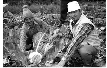
Proud teachers with fresh vegetables