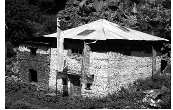
Thaktsen Rabgyeling – newly renovated