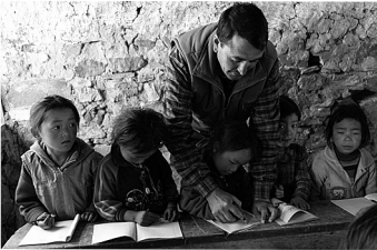
Everyday life at school