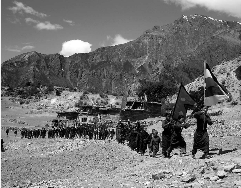
Students of the Tapriza School on the way to the Ringmo Festival

TAPRIZA SCHOOL & PROJECTS IN DOLPO – NEPAL