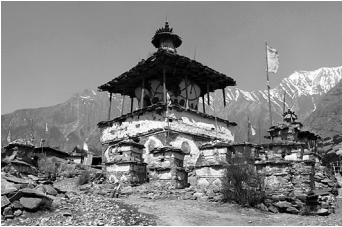
Shrine in Ringmo