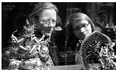
Objects of the Berti Aschmann Collection