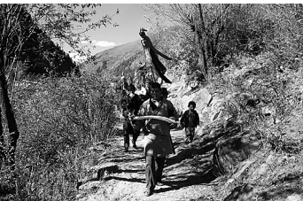
Ceremonial entry of the books

Great festivities are held at the newly renovated monastery in Pugmo to celebrate the acquisition of important holy Bon scriptures (Kangyur and Tengyur). The entry of the text collection is a premiere for the entire region Phoksumdo and therefore was accompanied with grand ceremonies.